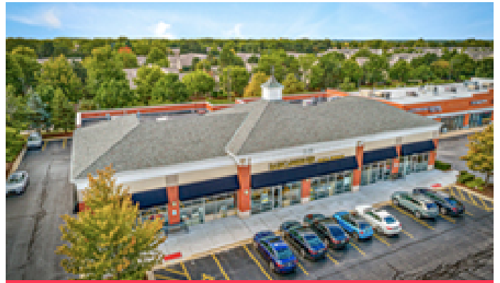
Highly Desirable Area in Naperville, IL

Built in 2001 in a highly desirable area.