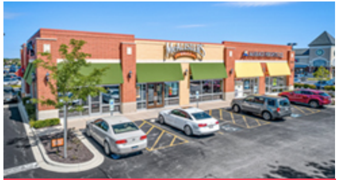
Busy Center with Great Walking Traffic

Boasts approximately 7,300 sq. ft. This center was built in 2015 and is a powerhouse shopping experience. Major tenants include McAllister's deli and Massage Heights. Please view the site plan and building photos!