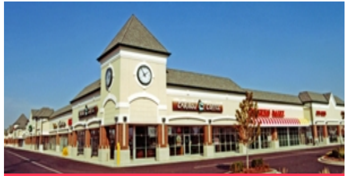
Powerhouse Shopping & Eatery Center in Naperville, IL

Boasts approximately 56,000 sq. ft. This center was built in 1999 and is a powerhouse shopping experience. Major tenants include Chase, Games Workshop, Hair Cuttery, MLC Toys II and The UPS store. High demand eateries include Lou Malnati's Pizzeria and Oberweis Dairy. Medical and other offices round out the offerings. Busy Center with great walking traffic.