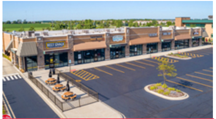
The Leader in The Nesler Road Retail Corridor

The Galleria II of Elgin is a 16,034 sq. ft. retail center. The first of its kind on the east end of Elgin. Bordering major residential developers with over 6500 new homes within a 3 mile radius. Please call to view the site plan and building photos!