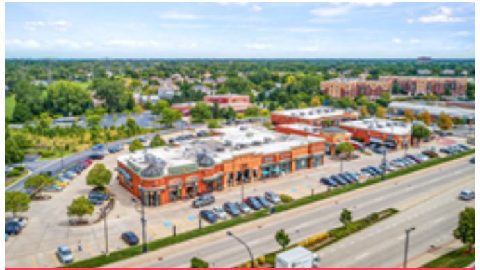
Situated in Addison's Entertainment District

16,000 sq ft retail center built in 2003. Located at 1600 West Lake Street in Addison's suburban entertainment district. Perfectly situated frontage on high traffic road and easy access to all major expressways. Major tenants include Chase Bank, Panera Bread and it's adjacent Starbucks. Busy center with great walking traffic.